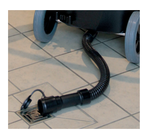
Integrated wastewater drain hose for easy emptying of the container.