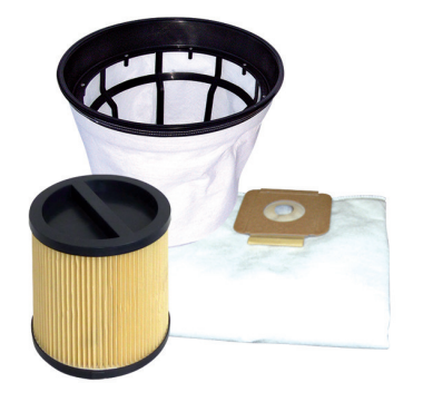
The fine dust cartridge, fleece filter basket and fleece filter bag guarantee an extra high filtration rate.