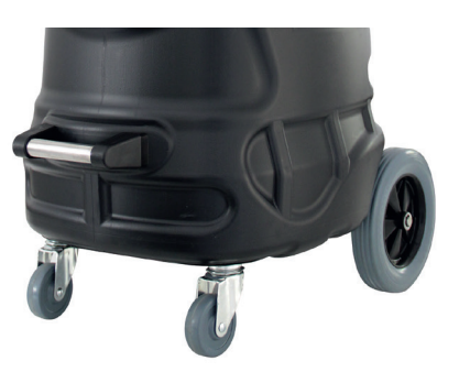
Larger rubber coated wheels for high comfort and silent running, even on sensitive floors.