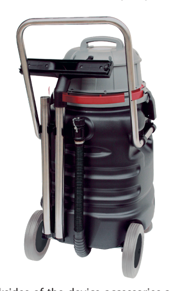
Backsides of the device accessories are easily accessible, while stored safely.