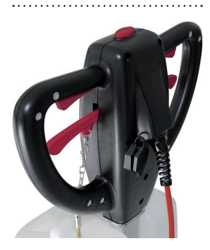
Ergonomic, solid handle element with robust switches and integrated bend protection for the power cord.