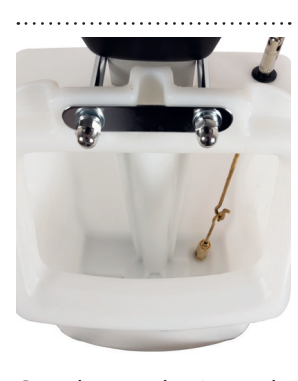
Complete mechanics made of metal. Parts that come into contact with water are made of brass.