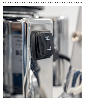
Button to change working speeds.