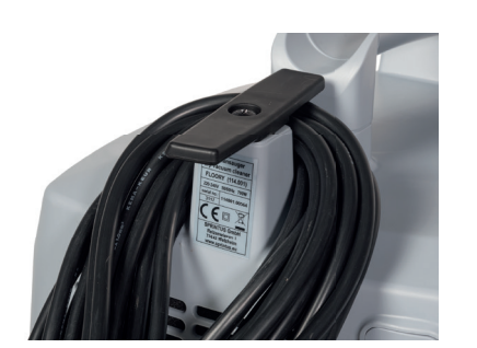
Closable, voluminous cable hook.