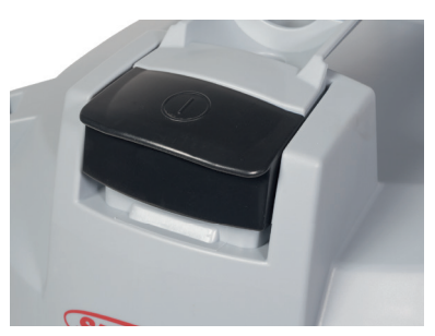
Large foot switch for turning on and off without bending down.