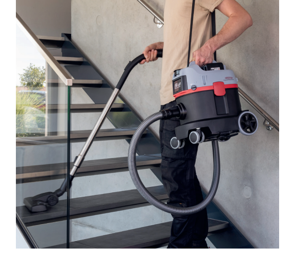
Thanks to the integrated, extendable carrying strap, you can easily carry the lightweight and compact vacuum cleaner over your shoulder especially in confined spaces and stairwells.