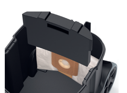
The extra storage space for filter bags saves time and enables changing the filter bag, especially when running out of stock.