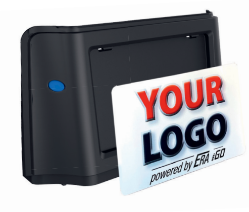
Your brand. Your company image. We imprint your logo.

Owing to a display on the motor head the power level as well as the battery status can be constantly monitored.